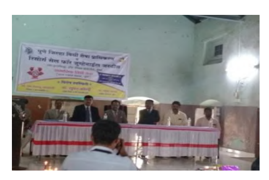
Visit to Juvenile Justice Board

Traffic (Prevention) Act, 1956, Protection of Women from Domestic Violence Act, 2005, Rights of the Accused and Legal Services. Around 40 destitute women were benefited.